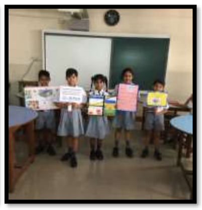
My School My Pride