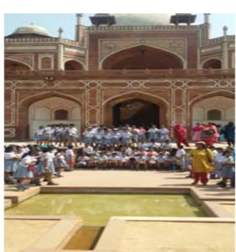
Admiring Breath taking Architectural Marvel