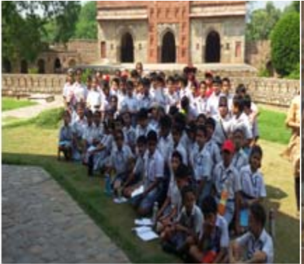
Captivating Majestic Monument