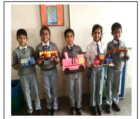
Substantiating their Prowess