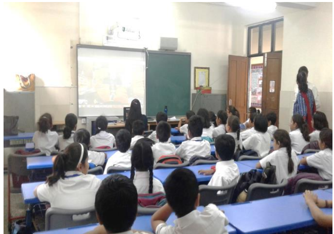
The world in our classrooms...