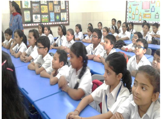
The engrossed audience