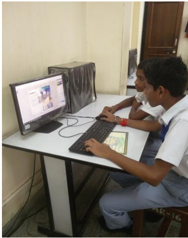
Creative Minds at work...

Sector – 21, Noida Phone : 0120-2534064, 2538533 / e-mail : bbpsnd@yahoo.co.in Website : http : www/bbpsnoida.com