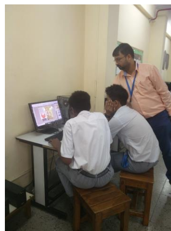
Judgement in progress...