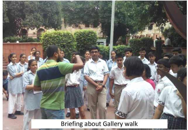
Briefing about Gallery walk

In an initiative of the National Gallery of Modern art to popularize & create awareness about international art over 100 works from the National Gallery of Australia- a collection of Aboriginal and Torres Strait Islander art which includes works by Australia's most important Indigenous artists were exhibited at the NGMA. 18 Students from Bal Bharati Public School, Noida visited exhibition on 25 th Aug,2018(Saturday) .