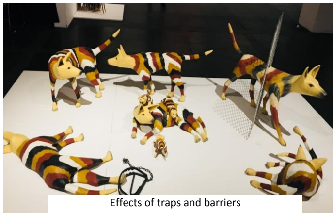
Effects of traps and barriers

and paintings, and through domestic and ritual objects.