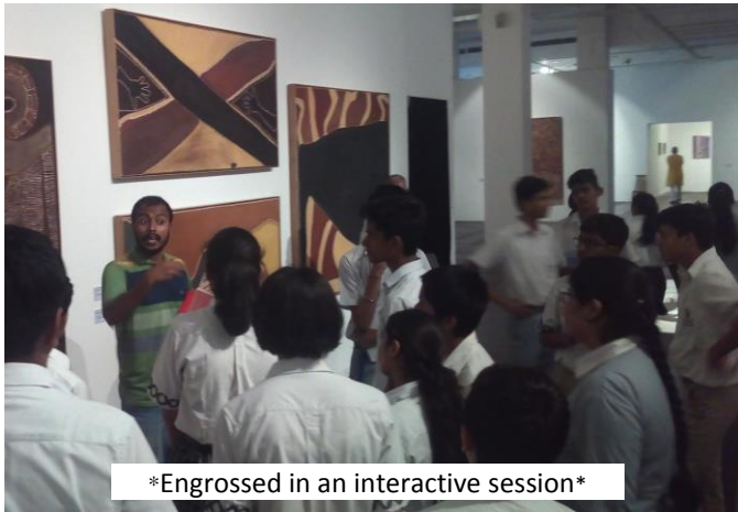
*Engrossed in an interactive session*

Content: Provided a comprehensive and fascinating insight into the worlds of traditional and modern art that emerged between the early nineteenth century and today. Paintings, videos, sculptures and installations reveal a great diversity of artistic styles and their recent developments. From rare, historical drawings to the dynamic Desert painting