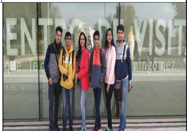
THE VISITING TEAM TO SPAIN