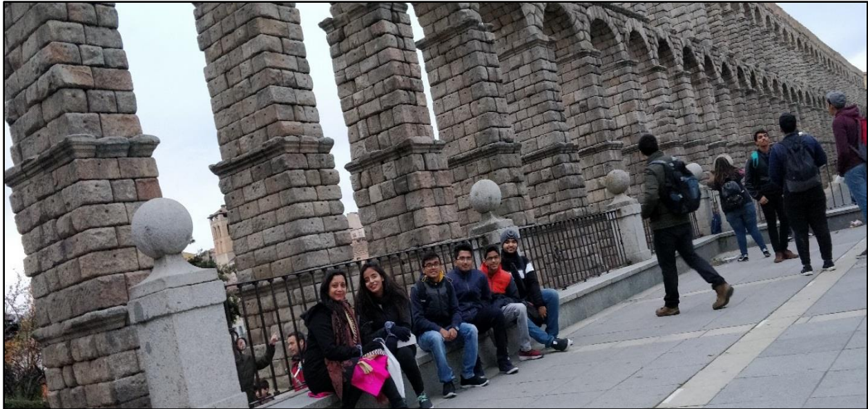
A WORLD HERITAGE – ‘ROMAN AQUEDUCT OF SEGOVIA’ - NORTHWEST OF MADRID

Our last day was visit to Segovia, a historical city near Madrid was extremely satisfying. Segovia