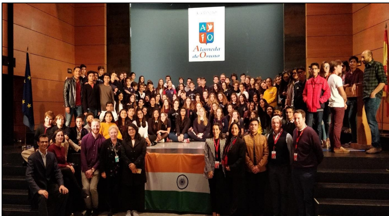
A VISIT TO THE SPANISH SCHOOL 'COLEGIO ALAMEDA DE OSUNA' - A CULTURAL BLEND

The students went to Colegio Alameda de Osuna, a 68-year old school, in Madrid in order to exchange educational as well as cultural views as representatives of their proud country. The Spanish teachers and principal of the school were very cordial and warm. We were welcomed with a small breakfast and then taken around in the school campus. The lawns in the