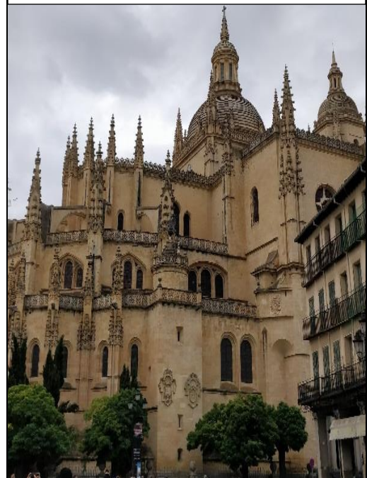
ORNATE GOTHIC CATHEDRAL

Such Educational trips that form a part of the school curriculum are very valuable as they provide the students the opportunity of learning through travel , especially to places that they may not otherwise get to visit .