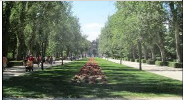
PARQUE DEL BUEN RETIRO, MADRID

The students visited the water management plant known as Canal de Isabel II where all the river water gets filtered. Processes such as sedimentation and centrifugation takes place to remove all the impurities and dirt and waste from the water of the rivers. After the visit, the students went to a Spanish restaurant to have a typical Spanish lunch which included paella and tortilla. After a splendid lunch, the students went on an afternoon walk at Retiro Park.