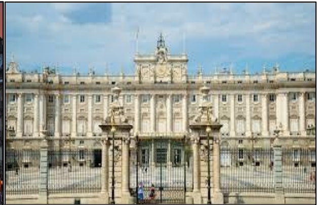
THE ROYAL PALACE, MADRID