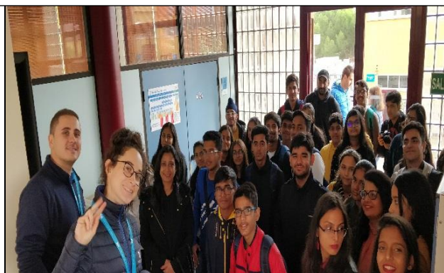
THE TEAM INTERACTING WITH CORDINATORS

Next day, the students visited the biggest waste management plant in Madrid in Valdemingomez, where all the waste of the city of Madrid is segregated and further sent for recycling. The employee of the plant helped us to understand the process. Segregation process was highlighted as it is the most important step to understand in