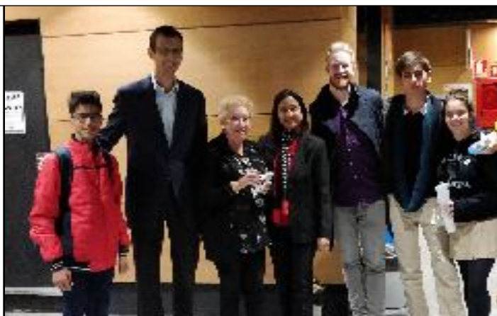
STUDENT INTERACTIONS WITH TEACHERS

The students went to Colegio Alameda de Osuna, a 68-year old school, in Madrid in order to exchange educational as well as cultural views as representatives of their proud country. The Spanish teachers and principal of the school were very cordial and warm. We were welcomed with a small breakfast and then taken around in the school campus. The lawns in the