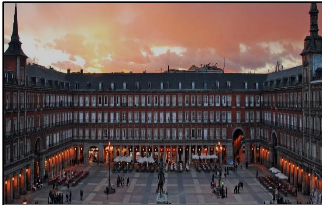
PLAZA MAYOR, MADRID