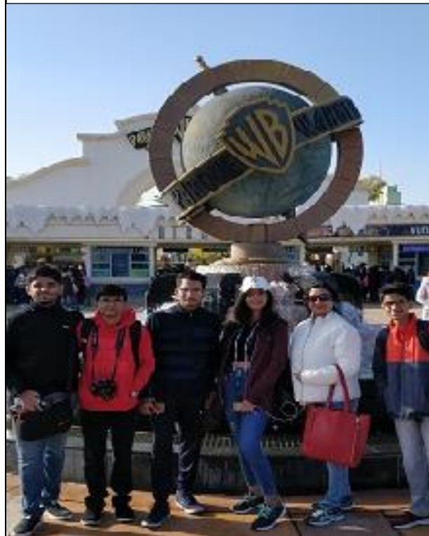
INSIDE THE FABULOUS THEME PARK