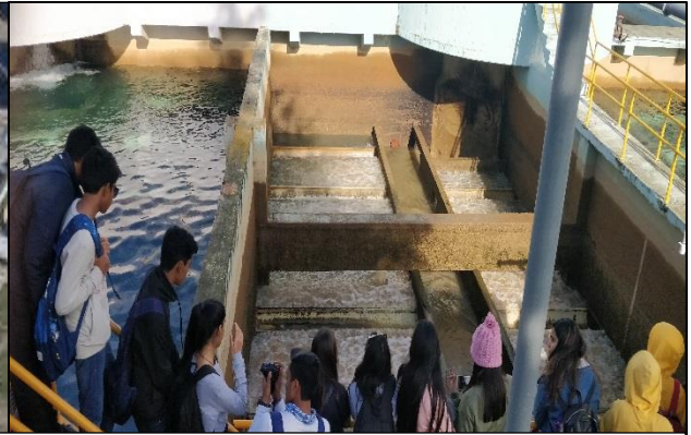
VISIT TO THE WATER TREATMENT PLANT-TEAM VISITING THE PLANT LOCATION

The students visited the water management plant known as Canal de Isabel II where all the river water gets filtered. Processes such as sedimentation and centrifugation takes place to remove all the impurities and dirt and waste from the water of the rivers. After the visit, the students went to a Spanish restaurant to have a typical Spanish lunch which included paella and tortilla. After a splendid lunch, the students went on an afternoon walk at Retiro Park.