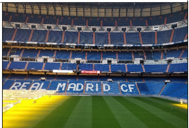
SANTIAGO BERNABÉU STADIUM, MADRID

After the walk, the students went to Estadio Santiago Bernabeu, which is the stadium of Real Madrid. Real Madrid which is one of the best teams, if not the best team in the world. The students got an amazing experience as they saw the stadium from the stands and then walked