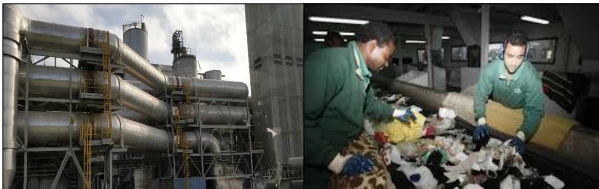
WASTE MANAGEMENT PLANT, VALDEMINGOMEZ- MANUAL SEGREGATION OF WASTE

Next day, the students visited the biggest waste management plant in Madrid in Valdemingomez, where all the waste of the city of Madrid is segregated and further sent for recycling. The employee of the plant helped us to understand the process. Segregation process was highlighted as it is the most important step to understand in