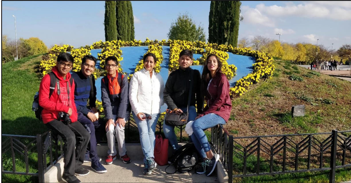
PARQUE WARNER MADRID, A THEME PARK - THE MAGIC AND RAZZLE-DAZZLE

We went to Parque Warner Madrid, which is located 23 km southeast the outskirts of Madrid. Warner Park is an amusement park which is based on the universe of Warner Bros. With big roller coasters to spooky haunted houses, this place was full of fun and excitement. We had a great time going to rides and roaming in the amusement park - Warner Bros. It was almost every attraction experienced, rollercoaster, shows and some meet n greets with Looney Tunes characters and Super Heroes characters like Batman and the Joker. A really cool park but the wait times are way to long even when it is not busy at all.