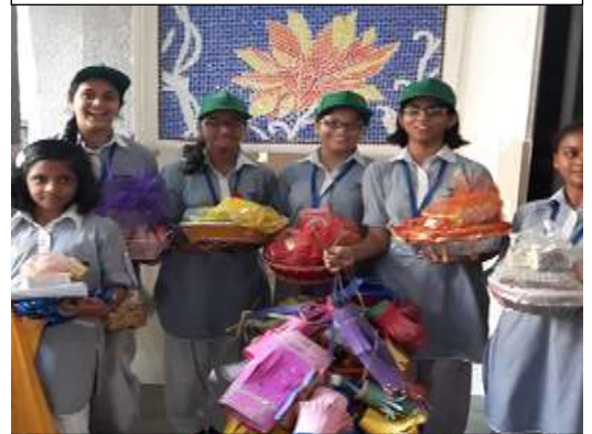
Students with gift hampers to donate