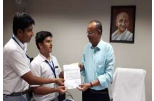
Handing over Letter of concern to DM