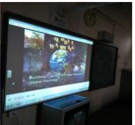
Screening Of Movie