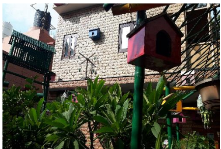
Bird Houses in the arena