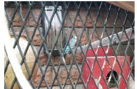
Blue Feathered Bird