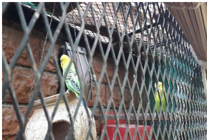
Yellow breasted parrot