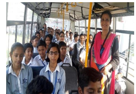
Students back to school