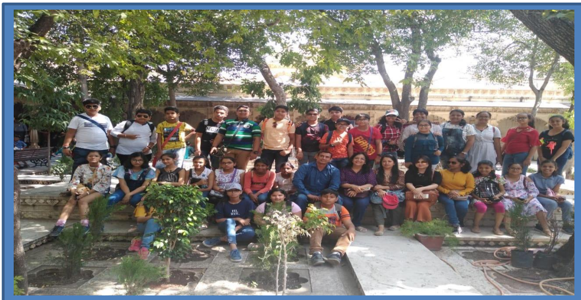
Exploring the City Palace

With shimmering Lake Pichola and a wide range of mountains in every direction, Udaipur is indeed one of the most beautiful and royal city of Rajasthan. In the evening, we returned to our hotel to appease our appetite and enjoyed a groovy DJ night.