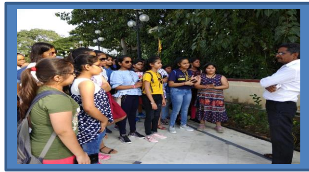
Engrossed in an interactive session

On 14 October 2018, the students visited Jagdish Temple and the City Palace - a museum with endless exhibits of the place down the ages, including amazing memorabilia of the royals. The view of the whole city was visible from the palace and its scenic beauty left everyone spell-bound.