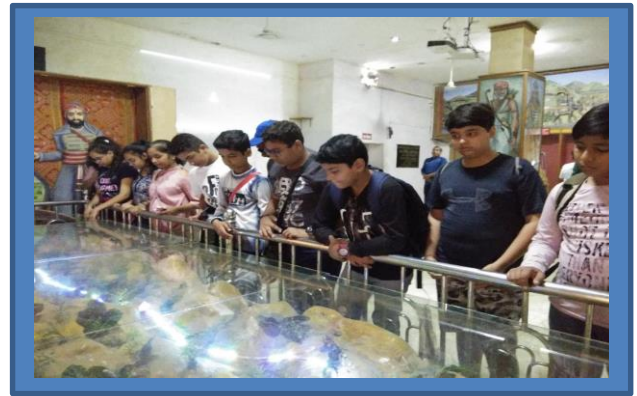
Witnessing the Legacy of Maharana Pratap at Haldi Ghati Museum

In the afternoon, we all departed for Kumbhalgarh Fort , the birthplace of Maharana Pratap, the great king and warrior of Mewar. The fort is humungous with a wall over 22 miles long. It is spread across a vast area and is among the largest wall complex in the world. The students also visited the Nav Durga temple inside the fort, where a flame has been burning since seven centuries.