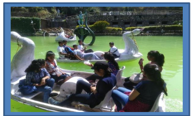
Boating at Fateh Sagar Lake and Haldi Ghati

However, the Maharana Pratap Smarak was the best of all. The exquisite, larger-than-life idol of the great Rajput on his horse was magnificent to behold. It was further glorified when the guide told the students the story of the Battle of Haldighati and one couldn't help but marvel at the courage of the king. By the time dinner was served at the hotel, everyone was looking forward to the next day.