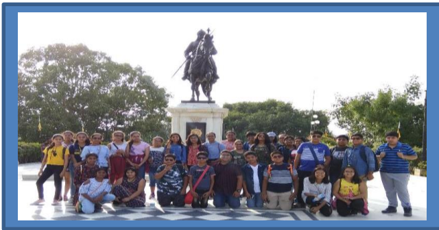
At Maharana Pratap Smarak